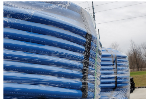
Figure 1. UPS can package Crystal Line HDPE pipe in coils, reels or straight line.